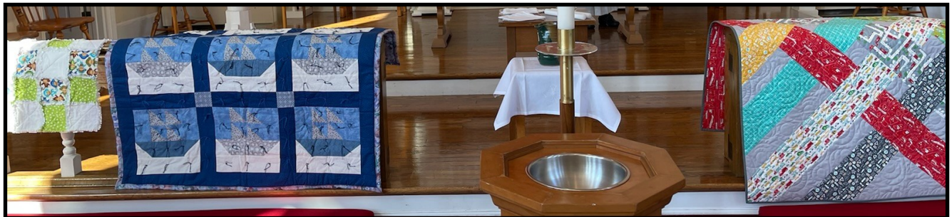
Quilts given at the baptisms on February 27 th

February is a short month, but we have been lucky to have good weather. We gather on Fridays from 10 until 2. Please come and join us. We can use your help. People throughout the world need the quilts and receive them through Lutheran World Relief. We also remember people in our area and synod who have needs or face unexpected problems. No need to know about how to quilt to be a member as we divide the tasks and can teach you one or more of the necessary skills. Many of our past members knew nothing about quilting when they joined the Piece Makers. One of our greatest pleasures is to make quilts for those who are baptized at St. Paul.