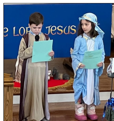
Poor Joseph has no lines in the Bible